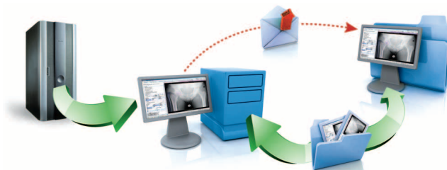
ImageShare - Collaborating over the Internet

Instant tips and prompts to guide you through the planning process