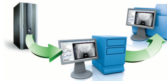
ImageShare - Improving Workflow in the Office